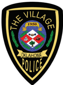
THE VILLAGE CRIME REPORT 2008

Overall reported crimes in The Village plunged 18.5% in 2008 to reach the lowest level in at least two decades. There are many factors which contribute to this improvement, but probably the most significant factor is the closing of the Vintage Lakes Apartments in April 2008. A recent study of crime in The Village pointed to these apartments as the source of between 20% and 30% of all the crimes committed in The Village. The apartments are to be demolished this spring and will be replaced by a new residential development.